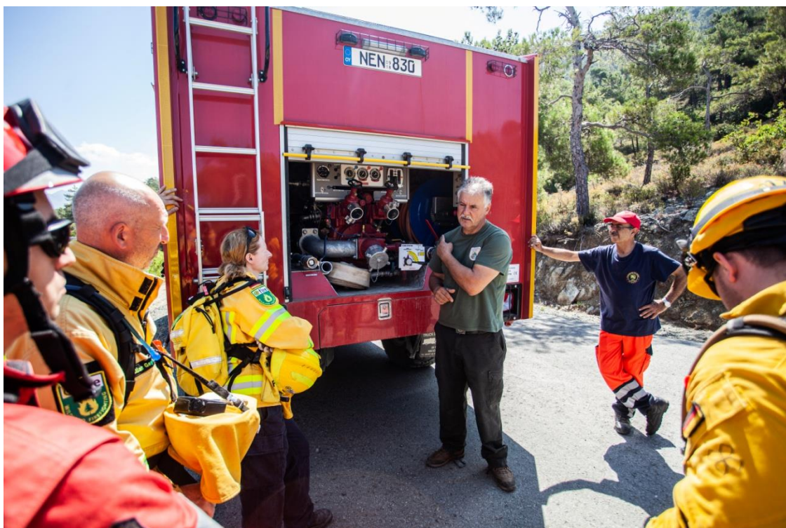
Practice with the Forest Department in Kakomallis Forest on the 3 rd International Forest Fire Training Camp 2019