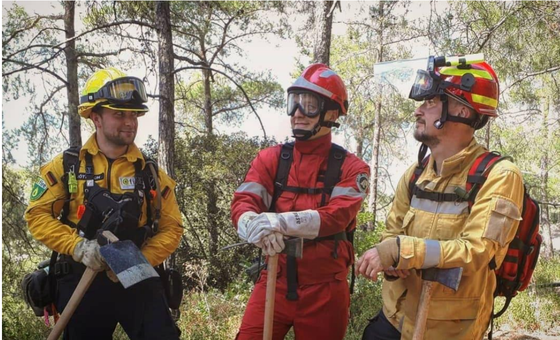
Team Leaders from Germany (@fire), Poland (LASZ) and Russia (Greenpeace) on the 3 rd International Forest Fire Training Camp 2019