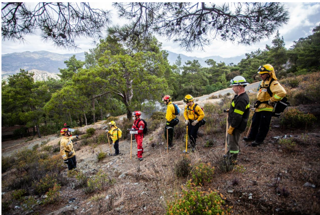
Fire Break construction in Kakomallis Forest on the 3 rd International Forest Fire Training Camp 2019