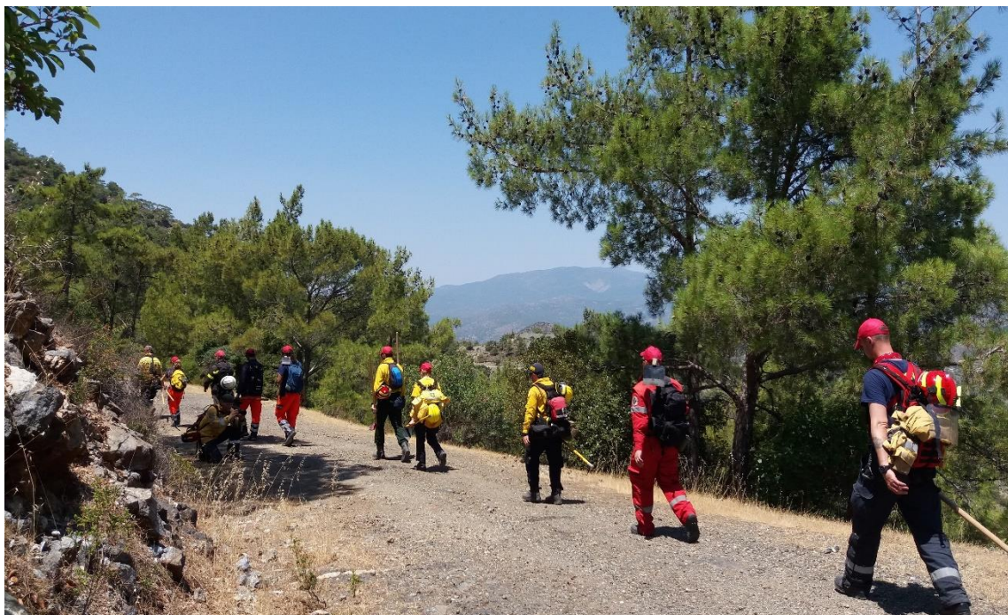
Foot Troops Patrol during High Risk Index in Kakomallis Forest on the 3 rd International Forest Fire Training Camp 2019