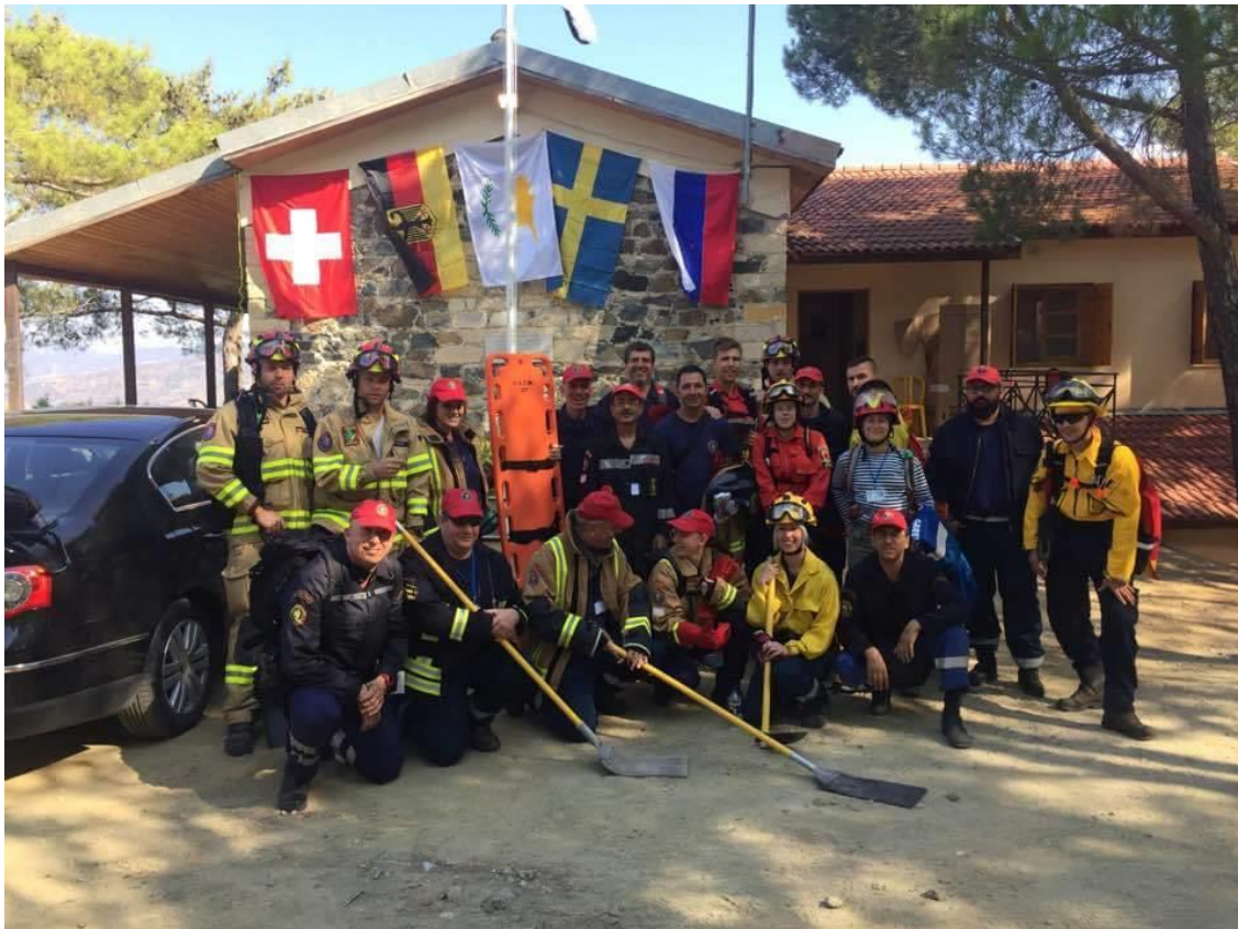
Participants from Cyprus, Greece, Germany, Sweden, Switzerland and Russia during the 1st International Forest Fire Training Camp 2017