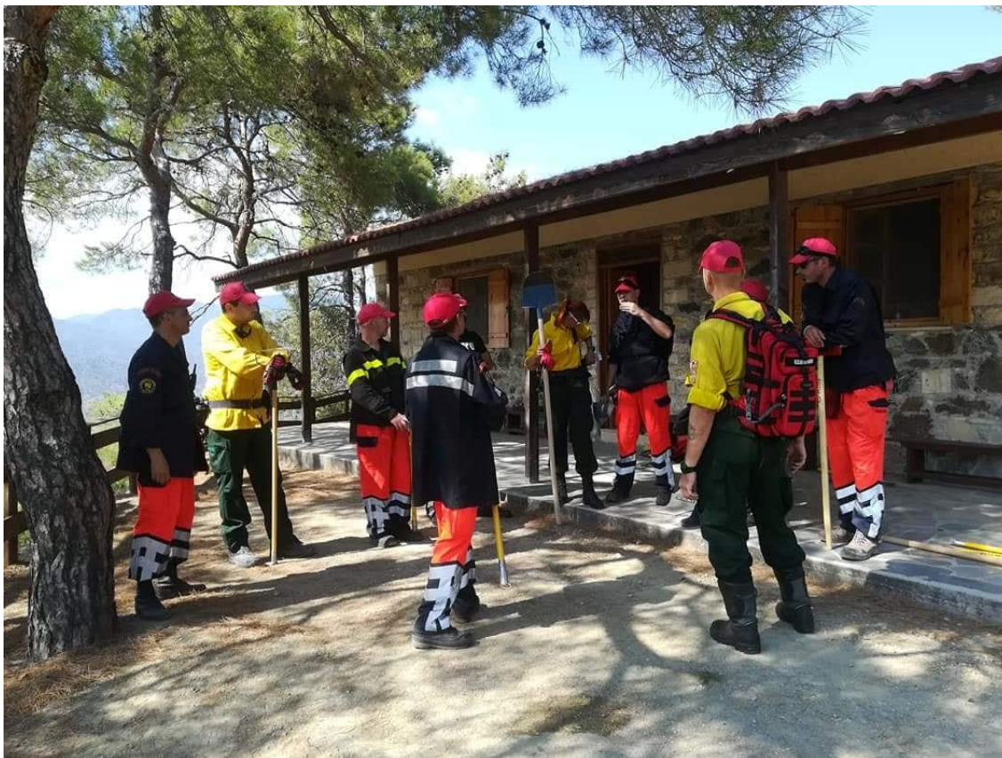
Briefing of team leaders before engagement in Pachna Fire during the 2 nd International Forest Fire Training Camp 2018