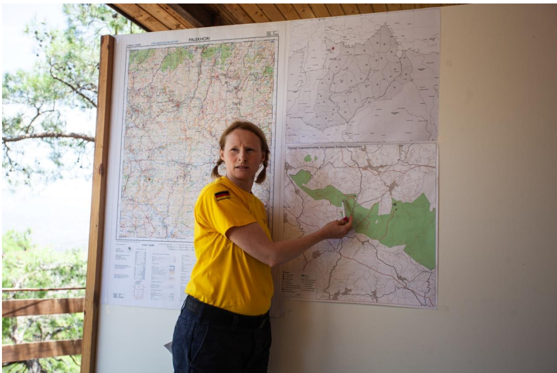
Situation Briefing- Incident Command practice in Kakomallis Forest on the 3 rd International Forest Fire Training Camp 2019